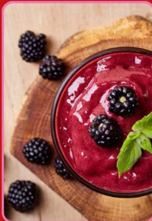
Fresh Fruit Smoothie